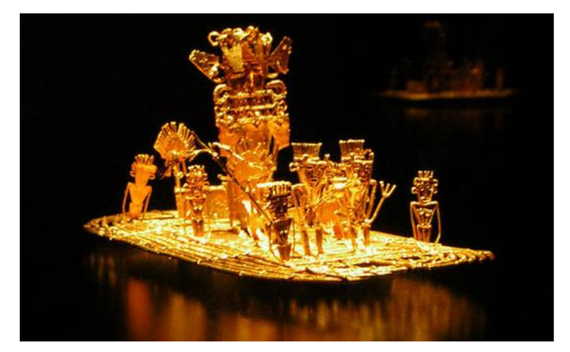
Fig. 2. The Muisca Raft. It is a representation of the legend of El Dorado. The cacique at the center of the raft is surrounded by attendants and oarsmen

The raft of El Dorado : The alloys of gold with copper or silver were produced by the pre-Columbian people to create wonderful statues and ornaments. In the Figure 2, it is shown one of such objects. It is the Muisca Raft, obtained in a lost-wax casting by the Muisca culture in a region which currently corresponds to the center of Colombia. A recent study on Muisca metallurgy shows that gold alloys were especially composed for votive metalwork [13], and in fact, the Raft is a votive object. Today, it is exhibited at the Gold Museum in Bogota. The Raft refers to the ceremony of El Dorado, during which Muisca chief, after covering his body with gold powder, dove into the Guatavita Lake. Then, El Dorado was El Hombre Dorado, the Golden Man.