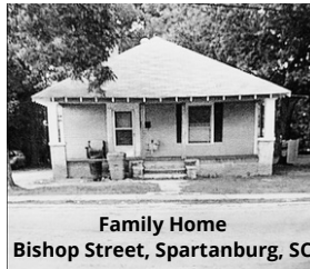
Family Home Bishop Street, Spartanburg, SC